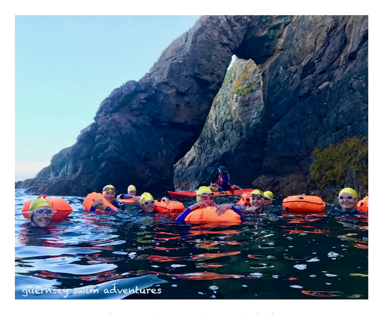
'Option to discover archways and gullies'