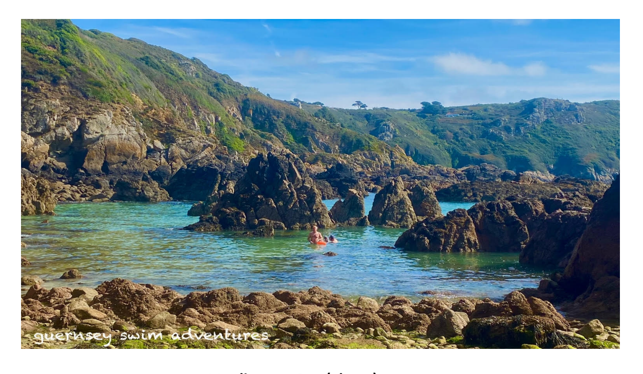
Moulin Huet Bay (above)

Guernsey Swim Adventures - contact 07911 719109 email gsyswimadventures@gmail.com 'Safe passage over water'