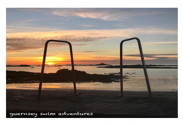
Cobo Bay sunset (above)

We will aim to swim late afternoon at a bay along the West Coast (1.5-2.0Km). following the swim, GSA will discuss the plan for the weekend.